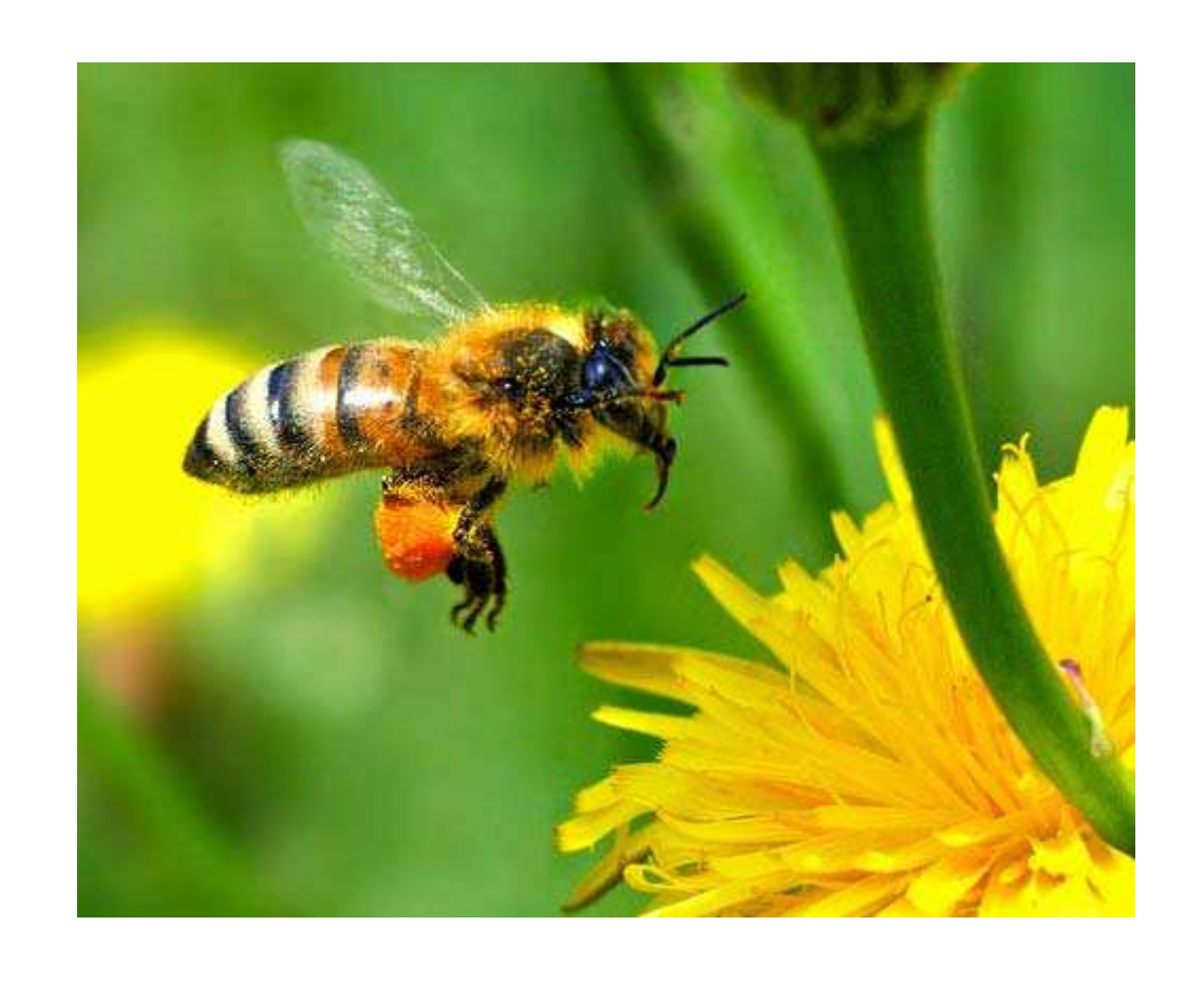
Honey Trade in the 21st Century